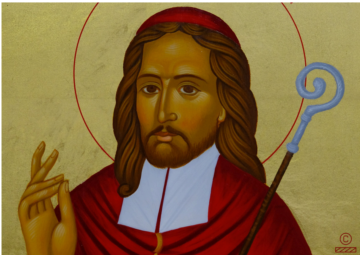
Icon of Oliver Plunkett used with kind permission of the Dominican Community at the Monastery of St. Catherine of Siena, Drogheda. (Image also used on booklet.) cover.