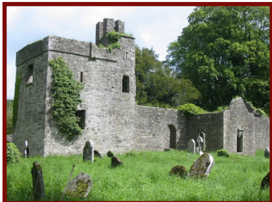
Loughcrew Church and Towerhouse

St. Oliver was born in Loughcrew, Oldcastle, Co. Meath on All Saints Day, 1st November 1625. He studied for the priesthood in Rome and returned to Ireland as the Archbishop of Armagh in 1670 after a 23 year exile. He immediately set to work and there was much work to be done as the Church in Ireland had been without proper leadership for almost thirty years.